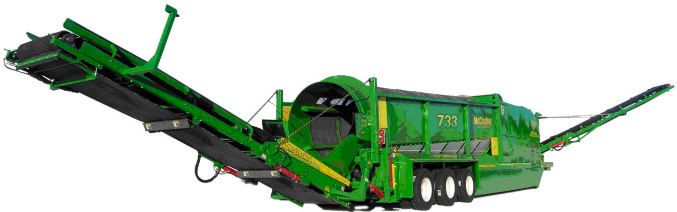
733RE model shown